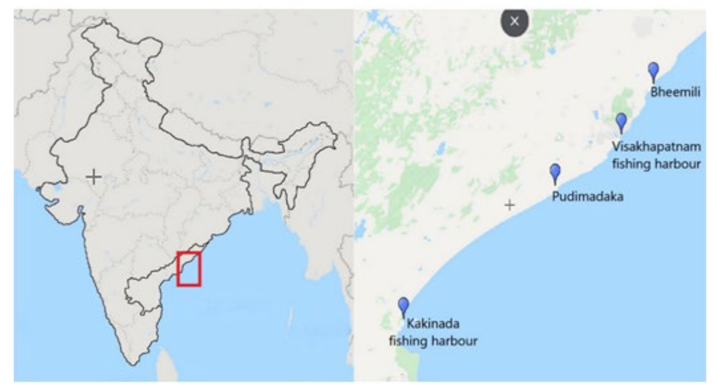
Figure 1: Sample collection areas along the coastal waters of Andhra Pradesh.