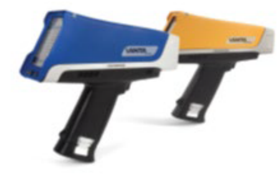
Figure 3: HHXRF set up.

Concentrations of accumulated elements namely As, Cd, Cu, Fe, Mn, Se, Zn, Ca, K and Mg in different tissues belong to the fishes collected from four different locations are determined by using the obtained spectra. The observed results relating to the fishes collected from Visakhapatnam fishing harbour are compared with those