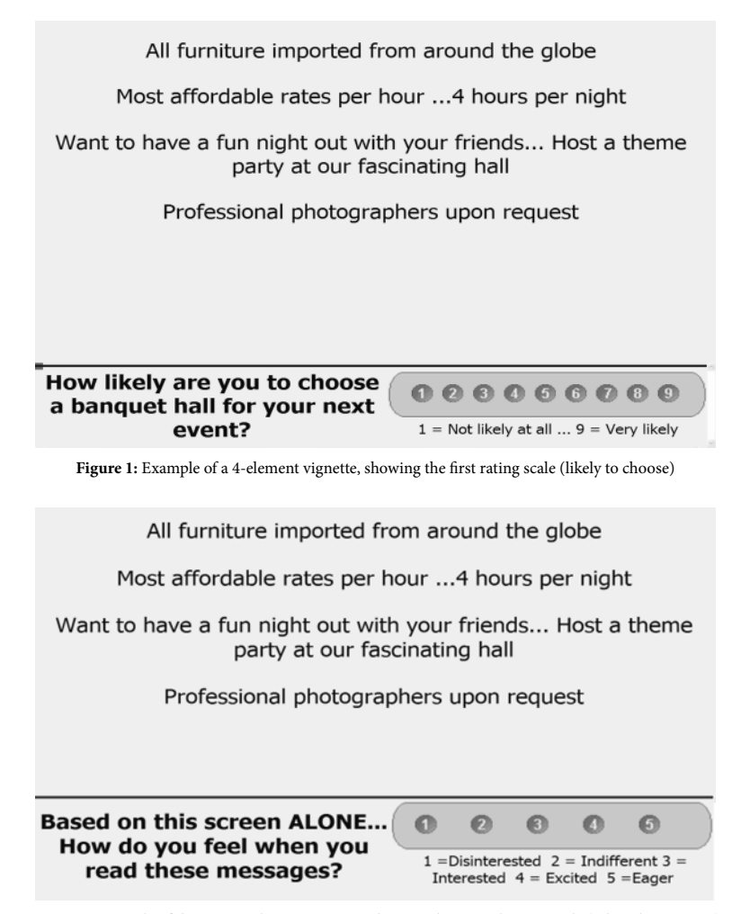
Figure 2: Example of the same 4-element vignette, showing the second rating scale (select the emotion)

3-dimensional image. The Mind Genomics strategy differs dramatically from the conventional approach of selecting a limited set of vignettes (e.g., 48), to represent all combinations, and then testing the same 48 vignettes with many respondents to average out random error.