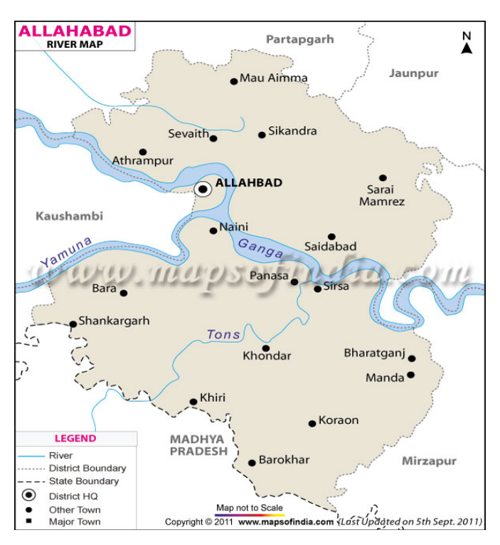
Map 1: Tons river map with Allahabad district now Prayagraj district. The sampling site Sirsa is confluence of Tons river from the Ganga river at Prayagraj, Uttar Pradesh.

Dr. Amitabh Chandra Dwivedi (2021) Invasion Potential, Impact and Population Structure of Non-native Fish Species, Cyprinus carpio (Linnaeus, 1758) from the Tributary of the Ganga River, Central India