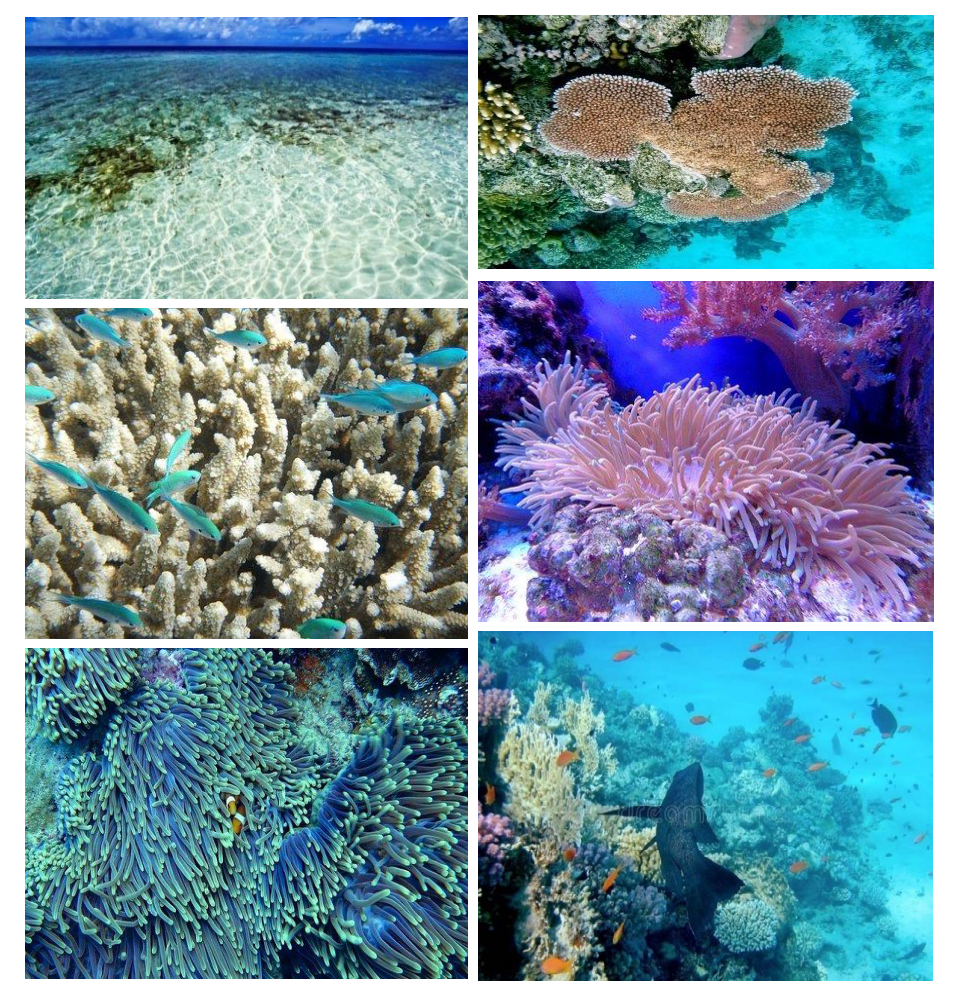
Figure 2: Coral from marines.

The clay and silt deposits have been used in making earthen small pot by earth potter and to some extent in making clay based crockery.