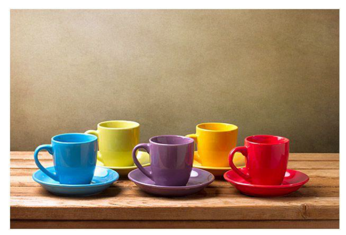
Figure 1a: Different sets of ideal non reactive coral vessels useable for dining.