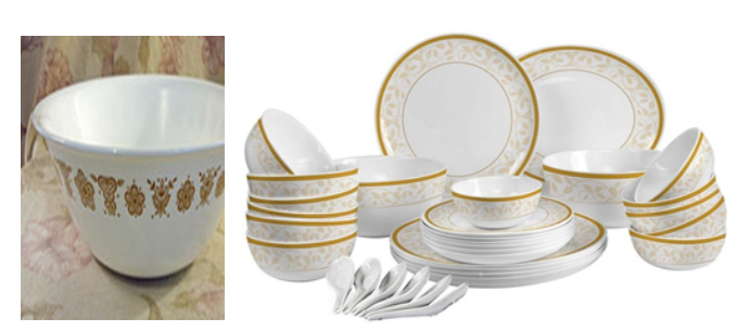
A non reactive bowl for breakfast

The globe is occupied by marine and sea even more than two third of surface. This vast resources must have been utilized in ways one might think in isolation for fishing and sea product. This chapter focuses that vast sea resource should be harnessed for use for fostering