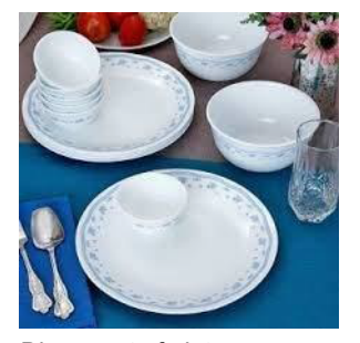
Dinner set of plates