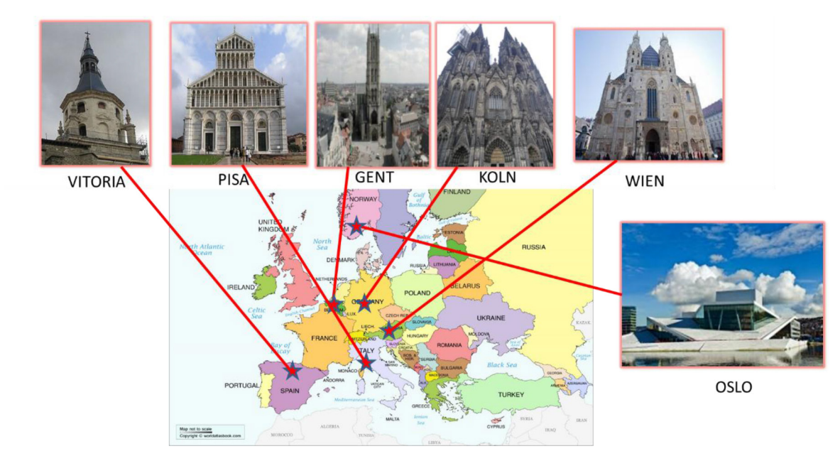
Figure 3. Involved European towns and respective monuments

Regarding the identification and development of nano-materials, it had the objective to make available nanomaterials formulations suitable as consolidants and protectives for each of the selected lithotypes to the laboratories for the characterization and to the cathedrals for the application (in small scale before and on site later). A list of consolidants and protectives has been preliminary identified and sent to all the monuments foundations responsible of their preservation for further validation. Then, taking into consideration the results provided by the laboratories dedicated to the testing of consolidants and protective treatments participating to the project, a selection was done. The selected products are reported in Table 1.