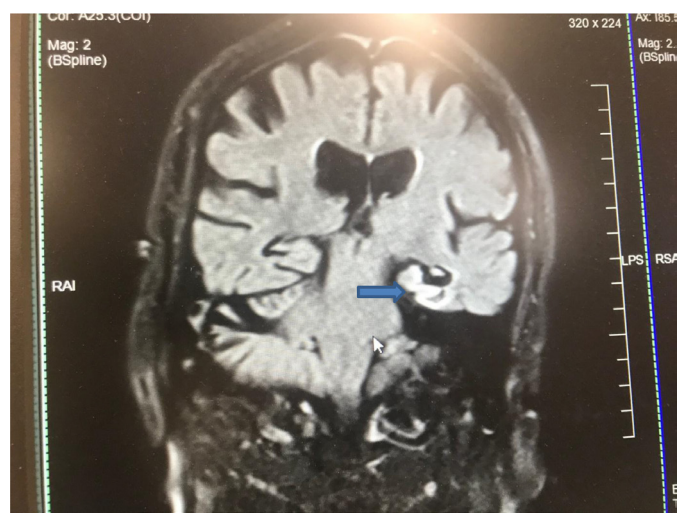
Figure 2. MRI Brain (diffusion-weighted image DWI) coronal view showing strategic infarct on the left Hippocampus (blue arrow)